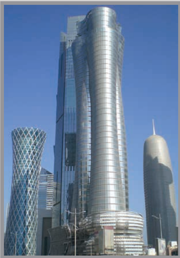
QIIB Tower West Bay