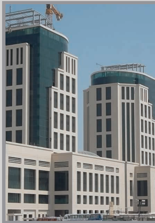
Al Jasra Twin Tower Lusail